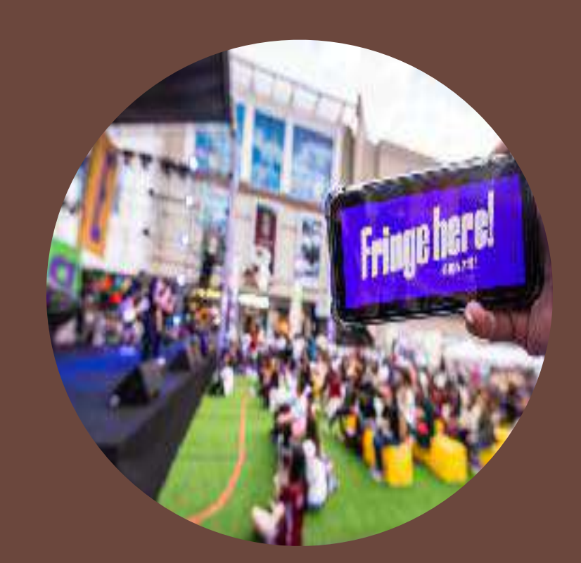
With the theme of "BE FRINGE", the festival emphasises the interaction between the festival and the city.